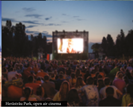
Herăstrău Park, open air cinema