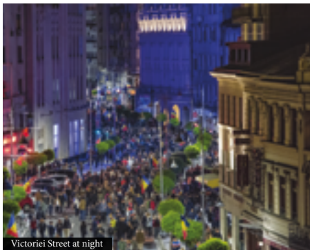
Victoriei Street at night

It goes without saying that everybody who travels to Bucharest, whether they are city citizens or tourists, will have a wonderful experience. When it comes to first impressions, things have a tendency to become eclectic, but this feature is what really captures visitors' interest once they learn about Bucharest's top tourist destinations. The capital boasts some exceptional historical buildings: The Palace of Parliament, The Romanian Athenaeum, The Romanian Peasant Museum, The National Museum of Natural History Grigore Antipa, The Arc de Triomphe - the city most iconic structure, a monument built to commemorate Romania's triumph in the First World War. Also, the historical center of Bucharest is a tourist destination in its own right.