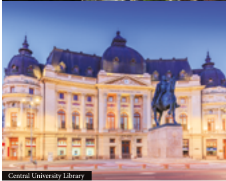
Central University Library